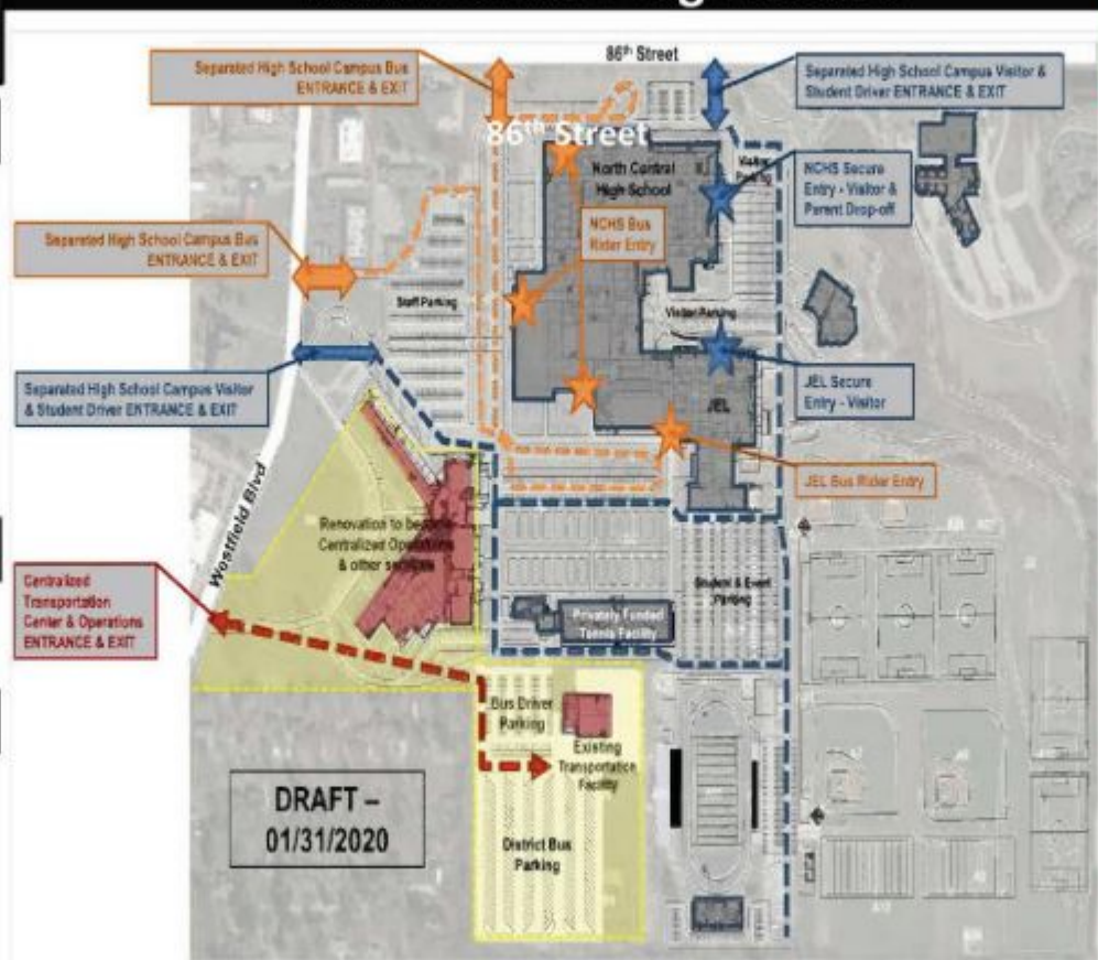
North Central High School DRAFT Plan 1/31/2020 (Operations Service Center/Transportation in yellow box)