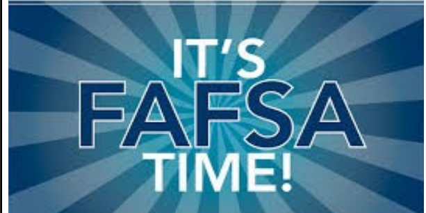
Evans Branigan III

FAFSA DAY WED DEC 7 8 AM - 7:30 PM UPPER PC LAB & IC